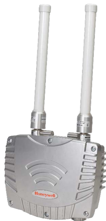
Honeywell Field Device Access Point (FDAP)

The Cisco Wireless Controller provides real-time communications